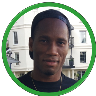
Didier Drogba (Football, UEFA Champions League winner, Ivory Coast)

In October 2005, after the first qualification of Ivory Coast for the football World Cup, the captain of the "Elephants" calls his people to reason during the civil war. This "Appeal of Khartoum" is the first act of Ivorian reconciliation. He created his Foundation in 2007, donating all his commercial income to benefit to actions improving access to health and education. He is ambassador of the "Caravan for Peace".