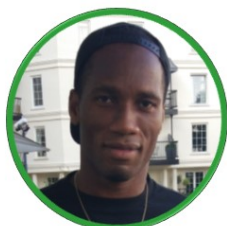
DIDIER DROGBA IVORY COAST - FOOTBALL