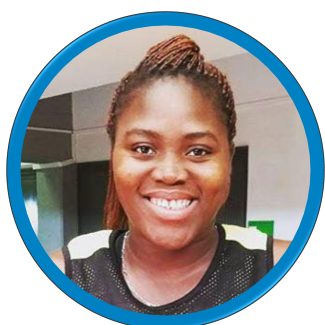
Isabelle Yacoubou (Basketball, Captain of National Team, France)

Born in Benin, Isabelle played for her country in the junior World Championships, following which she sent a video of herself to the club in Tarbes, France, who recruited her at age 17. Three years later, she obtained French nationality and won the European title in 2009, going on to win the silver medal in the 2012 Olympics. Still wishing to be involved with her country of origin, she founded Basketball Week and would like to set up an Academy as soon as her sporting career is over.