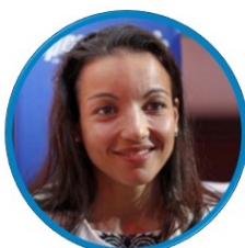
SARAH OURAHMOUNE FRANCE - BOXING