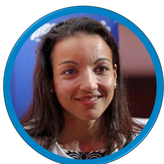
Sarah Ourahmoune (Boxing, World Champion, France)

Representative of ‘Team Solide’ Sarah is a pioneer of women’s boxing. government representative in Seine-Saint-Denis, she opens her own boxing club in Paris. Deeply committed, she runs several projects for social reinsertion, people with disabilities and sexual equality. In summer 2017, Paris2024 chose her to uphold the Olympic legacy which has the objective of investing in programs for young people in outlying districts of Paris.