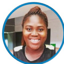
ISABELLE YACOUBOU FRANCE - BASKETBALL