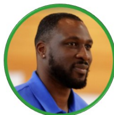
FLORENT PIETRUS FRANCE - BASKETBALL